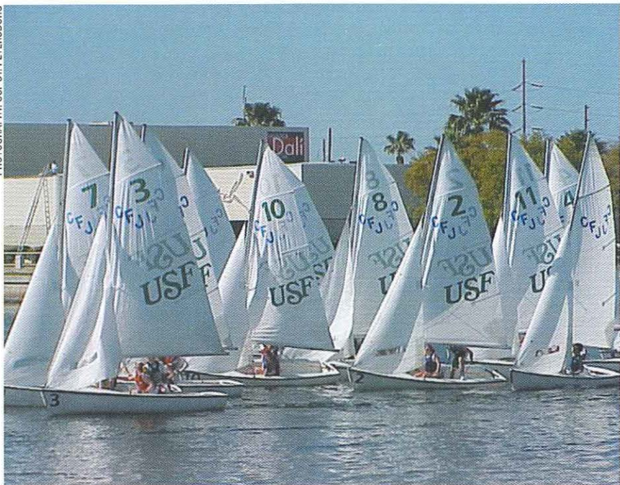
The USF women's sailing team practices maneuvers in the waters off USF St. Petersburg.